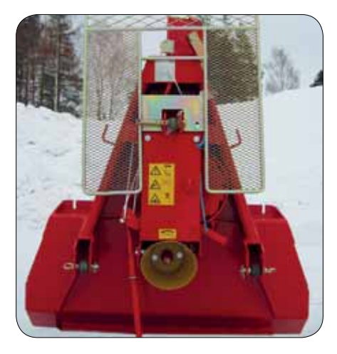
Power shaft in the center line of the winch

FARMI 501 winch (with 5 t pull for tractors from 35 HP on) is manufactured with an integrated butt plate and a vertically adjustable lower cable pulley: a light, stable and reliable winch.