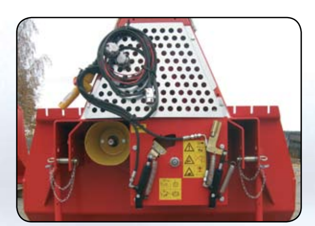
Electrohydraulic operation HOF as an accessory